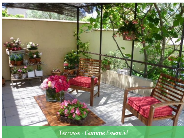
Terrasse - Gamme Essentiel