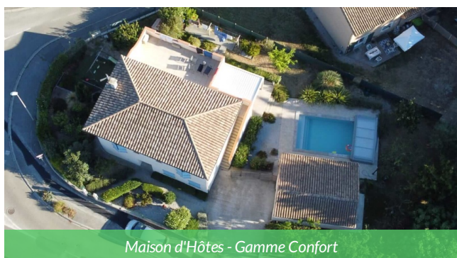
Maison d'Hôtes - Gamme Confort

Maison d'hôtes labellisée « Accueil Vélo » et « Chambre d'hôtes Référence », nichée dans un quartier résidentiel paisible à quelques pas des berges du Canal du Midi. Les chambres climatisées sont équipées d'une salle de bain privée, de toilettes séparées, du Wi-Fi gratuit et d'un garage sécurisé pour vélos. Un parking privé, un jardin clos et une piscine extérieure sont à disposition, faisant de cette étape un choix idéal pour une halte à vélo en Occitanie.