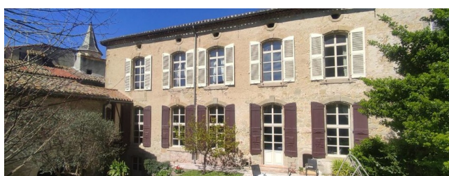
Hôtel - Gamme Privilège

Situé au cœur du Lauragais, cet hôtel **** à Castelnauudary est une halte idéale pour un voyage à vélo le long du Canal du Midi. Installé dans un hôtel particulier du XVII e siècle, il propose des chambres confortables, un petit-déjeuner maison, un parking sécurisé et un accueil chaleureux pour les cyclotouristes. Entre authenticité, confort et emplacement central, c'est l'adresse parfaite pour une étape détente à vélo.