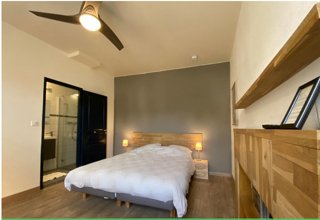
Double Room - Confort Range