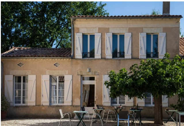
Guesthouse - Confort Range

In the heart of the Médoc vineyards, this wine estate offers a peaceful retreat in an elegant and authentic setting. Carefully appointed rooms open onto a lush, green environment ideal for rest and relaxation. The outdoor swimming pool invites you to unwind after a day of exploring châteaux, villages, and wine routes, for a stay infused with the gentle pace and art de vivre of the Médoc.