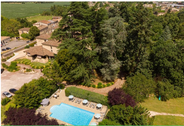
Castel - Confort Range

Set in a peaceful setting at the heart of the Entre-deux-Mers vineyards, this property charms guests with its serene atmosphere. It also features an outdoor swimming pool, ideal for relaxing after a day of exploring the Garonne valley, charming villages, and vineyard landscapes. An elegant and restful place — perfect for ending your cycling holiday.