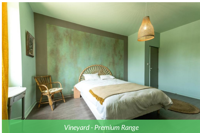
Vineyard - Premium Range

This character residence is set within a vast, tree-lined park on the outskirts of Bordeaux. The property combines the charm of classical architecture with contemporary features designed for comfort, including elegant and well-equipped rooms, bright communal areas, terraces, and an outdoor swimming pool for relaxing during the warmer months. Its peaceful surroundings, while remaining close to the city center and the vineyards, make it an ideal stopover for combining rest, nature, and discovery of the Bordeaux region.