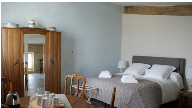
Double Room - Confort Range

Nestled in a green haven just steps from the Gironde estuary, this guesthouse charms visitors with its peaceful and welcoming atmosphere. Comfortable rooms, a jacuzzi, and a garden invite you to relax, while the nearby village of Bourg-sur-Gironde offers lovely strolls through charming streets, scenic river views, and a gentle local way of life.