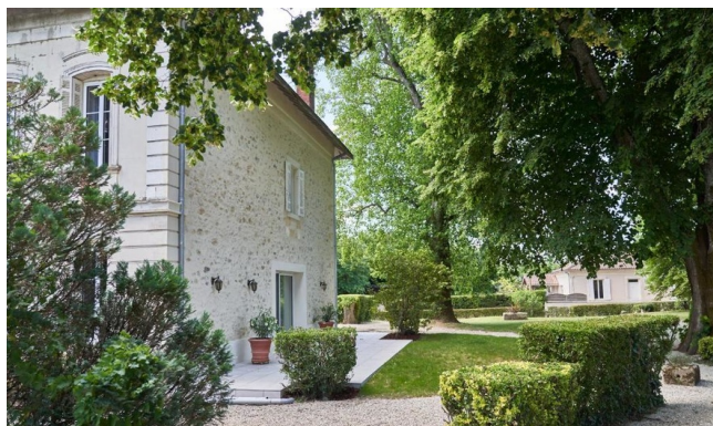
Garden - Premium Range

This elegant character residence is located in the heart of the Sainte-Croix-du-Mont vineyards, overlooking the Garonne Valley. The accommodation charms guests with its comfortable and refined rooms, welcoming common areas, and peaceful surroundings. The tree-lined garden and wine estate provide an ideal setting to relax at the end of your cycling journey.