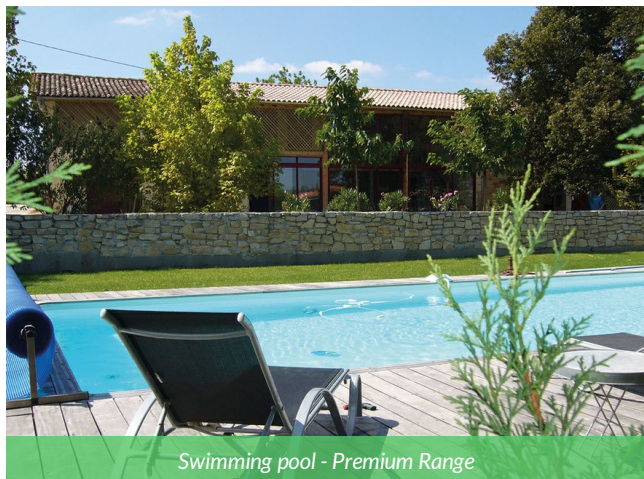
Swimming pool - Premium Range

a quiet escape combining wine heritage, nature, and the Bordeaux art of living.