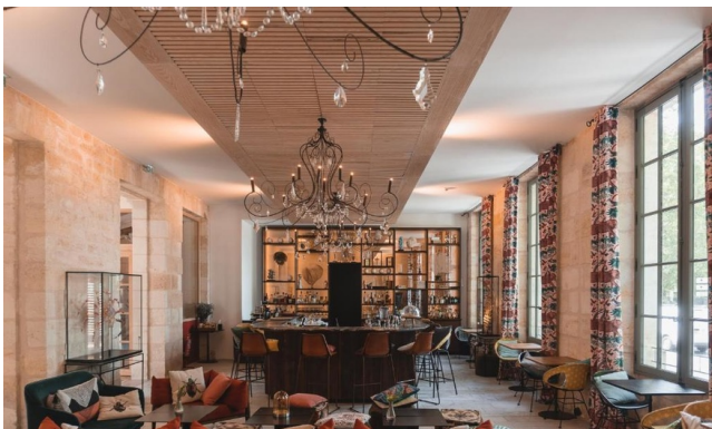
Reception - Premium Range

This unique property is set in a former university building elegantly renovated to blend architectural heritage with contemporary design. Generous spaces, natural light, and raw materials create an atmosphere that is both urban and soothing. The hotel offers spacious and comfortable rooms, carefully designed common areas, a welcoming restaurant, and facilities dedicated to well-being, providing a modern and refined hotel experience in the heart of Bordeaux.