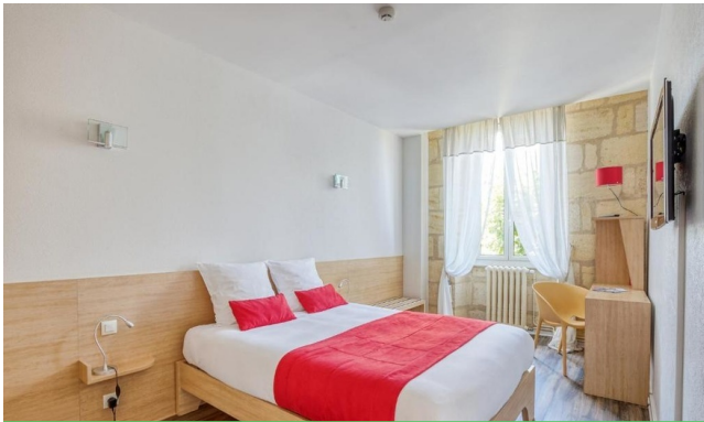
Double Room - Confort Range

You will enjoy a stay in the heart of Bordeaux, in a hotel rich in history. Built from the city's iconic golden stone, this establishment has stood since 1850. You will quickly feel at home and particularly appreciate the warm, friendly, and attentive welcome, as well as the high standards of cleanliness for which the hotel is known. The décor, the emblematic golden stone of Bordeaux, the bright common areas, the charming staircase, and the guesthouse-style atmosphere will all delight you and provide the perfect setting to begin your stay.