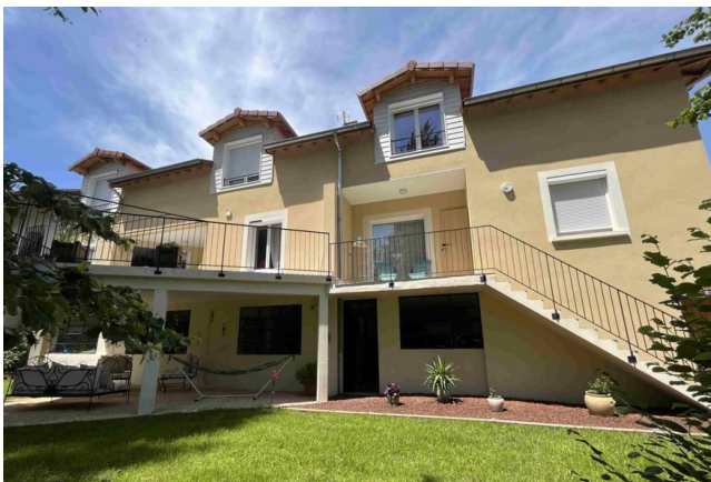
Our partner accommodation in Bouchet-Saint-Nicolas

For this package, we offer a selection of simple, comfortable hotels, gîtes or guest houses.