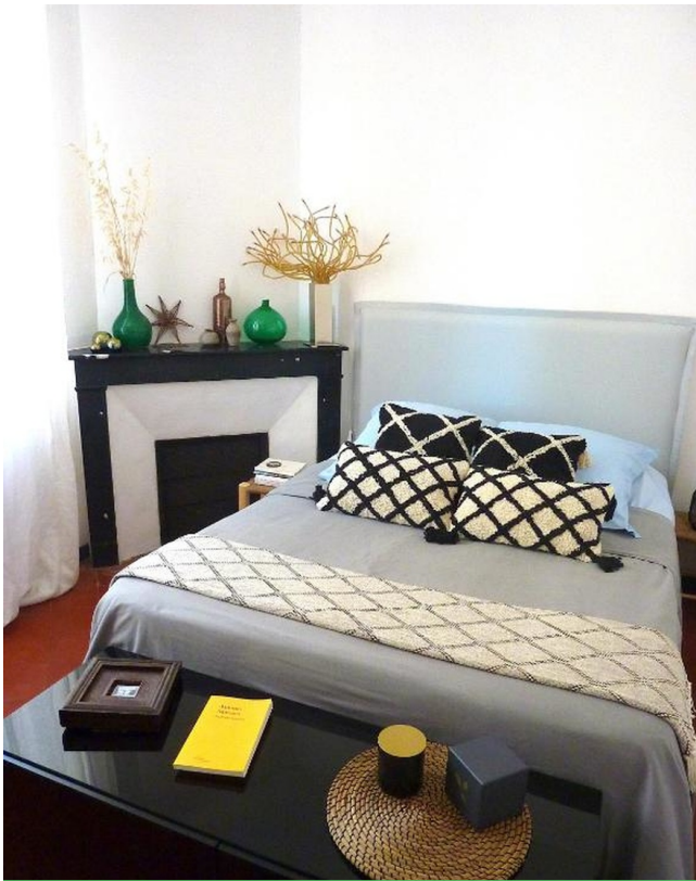
Double Room - Confort Range

of the South, before continuing your route through vineyards towards the colours of the Mediterranean.