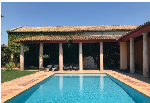
Swimming pool - Exceptional Range

Here you will find one of the most beautiful châteaux in the area, with our partner guaranteeing an exceptional setting and welcome. Relax by the pool or take a moment in the spa before treating your palate to finely prepared dishes.