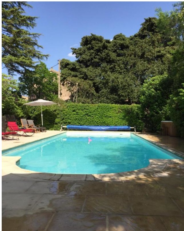
Swimming pool - Confort Range

Located in the heart of Olonzac, in the centre of the Minervois region, this accommodation is an ideal stop on your cycling journey from Carcassonne to Collioure along the Wine Route. This characterful house offers a warm welcome and a peaceful setting amid the vineyards, perfect for unwinding after a day spent between the Canal du Midi, wine estates and the landscapes of Languedoc. Close to typical villages and Minervois wineries, it is a preferred address for cyclists seeking comfort and authenticity in Occitanie.