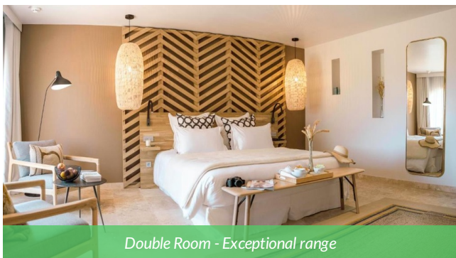
Double Room - Exceptional range

An ideal stop on a cycling journey, this 4-star hotel combines modern comfort with refined charm. After a day of cycling, enjoy cosy rooms, attentive service and a warm atmosphere to unwind and recover. Located in the heart of the region, it allows you to combine relaxation with local discoveries, offering a perfect break between landscapes and nearby vineyards such as the Domaine d'Auriac.