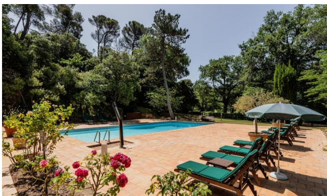
Swimming pool - Exceptional Range

Located in the Languedoc wine region, this estate is a renowned vineyard producing high-quality red, white and rosé wines. Sun-drenched hills and endless rows of vines create an ideal setting for a cycling journey. Visitors can discover the estate's history, take part in wine tastings and enjoy an authentic, friendly atmosphere. A perfect starting point to combine sport, nature and the pleasure of wine.