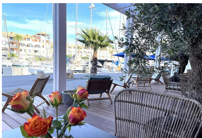
Terrasse - Gamme Confort

L'hôtel à Leucate est une adresse idéale pour une étape en bord de mer lors d'un voyage à vélo de Carcassonne à Collioure sur la route des vins du Roussillon. Situé entre l'étang de Leucate et la Méditerranée, l'hôtel offre un confort moderne et un accès direct aux pistes cyclables du littoral. À proximité, les voyageurs peuvent découvrir les produits locaux : huîtres de Leucate, vins du plateau, fruits de mer, miels du littoral et spécialités catalanes. Une halte parfaite pour savourer le terroir méditerranéen avant de reprendre la route vers les paysages colorés de Collioure.