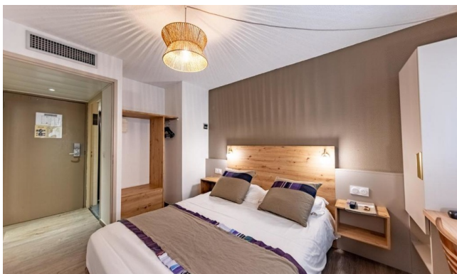
Double Room - Confort Range