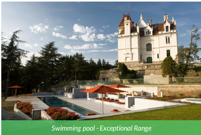
Swimming pool - Exceptional Range

On the shores of the Mediterranean, our partner will be delighted to welcome you to an old house dating from the 1870s, which has retained all its original splendour. In the midst of the old stonework, you can relax and enjoy the architecture of this beautiful building, with its French savoir faire.