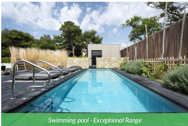
Swimming pool - Exceptional Range

An ideal stop on a cycling journey, this 4-star hotel combines modern comfort with refined charm. After a day of cycling, enjoy cosy rooms, attentive service and a warm atmosphere to unwind and recover. Located in the heart of the region, it allows you to combine relaxation with local discoveries, offering a perfect break between landscapes and nearby vineyards such as the Domaine d'Auriac.