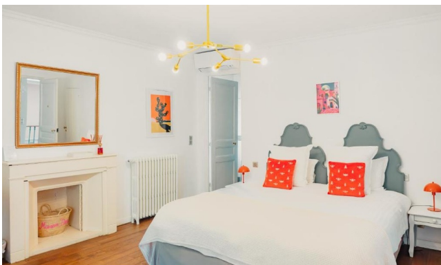
Double Room - Privilège Range

Neoclassical-style guesthouse dating from the late 19th century, located facing the historic center of Arles. It offers a prime location in the heart of the city while providing a peaceful charm with its garden and shaded terrace. The rooms, with a clean and warm style, are all equipped with quality bedding and air conditioning.