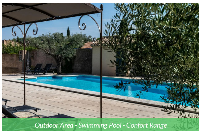
Outdoor Area - Swimming Pool - Confort Range

The hotel stands out for its 2,500 m 2 garden, outdoor swimming pool, shaded terrace, and welcoming bar. It is located just a few minutes from the historic center of Saint-Rémy.