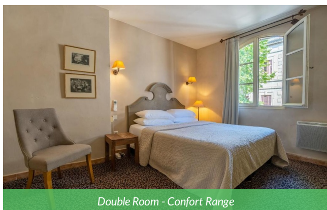
Double Room - Confort Range

Start your day with a gourmet breakfast featuring local products, enjoy the service of bilingual staff, and benefit from an ideal location that allows you to explore the city's most beautiful sites on foot.