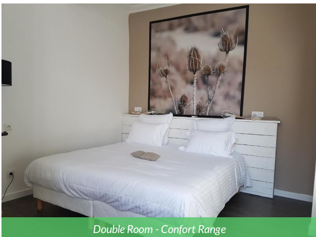
Double Room - Confort Range

This charming hotel is close to Place Saint-Louis, the Constance Tower, and the Church of Notre-Dame des Sablons. A small hotel with only 10 rooms, all equipped with every necessary comfort, quality bedding, and air conditioning.