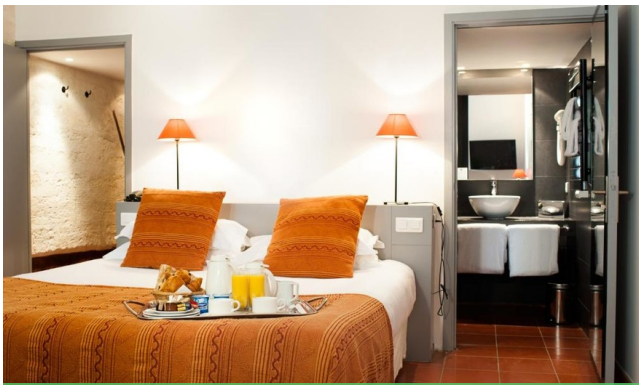
Double Room - Privilège Range