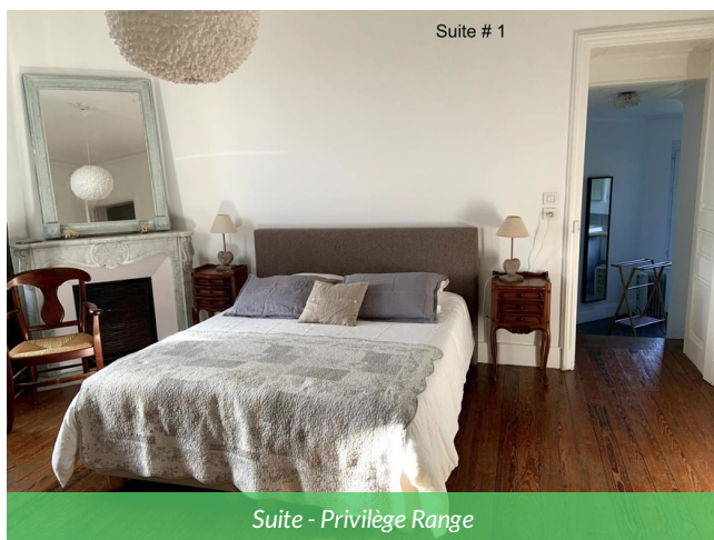
Suite - Privilège Range