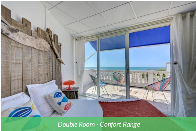
Double Room - Confort Range

Charming establishment facing the sea in the heart of the village of Les Saintes-Maries-de-la-Mer, in the Camargue. The hotel offers a selection of spacious rooms in a friendly and welcoming setting, typical of the Camargue atmosphere. A quality breakfast is served, and most of the rooms are equipped with air conditioning.