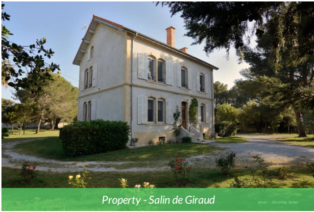
Property - Salin de Giraud