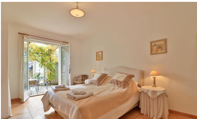
Double Room - Privilège Range

In the heart of the Alpilles, just 5 minutes from the historic center of Saint-Rémy-de-Provence, this beautiful guesthouse offers Provençal charm, combining tranquility and a welcoming atmosphere. Surrounded by lovely gardens and featuring a refreshing swimming pool, this guesthouse provides the perfect escape from everyday life. The rooms are decorated in a typical Provençal and romantic style and offer all high-quality amenities.