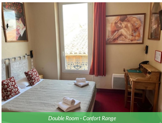
Double Room - Confort Range