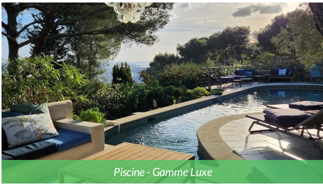
Piscine - Gamme Luxe