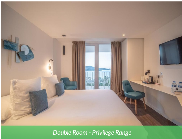
Double Room - Privilege Range