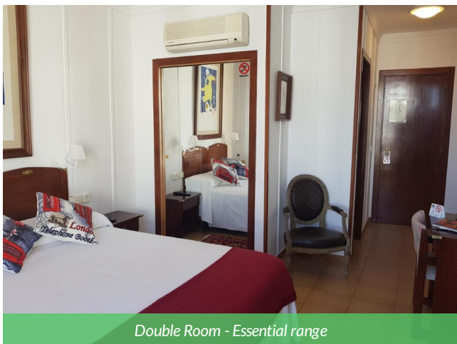
Double Room - Essential range