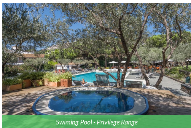
Swimming Pool - Privilege Range