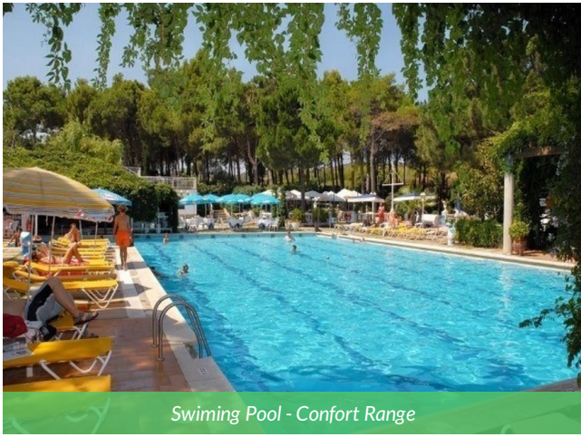
Swimming Pool - Confort Range