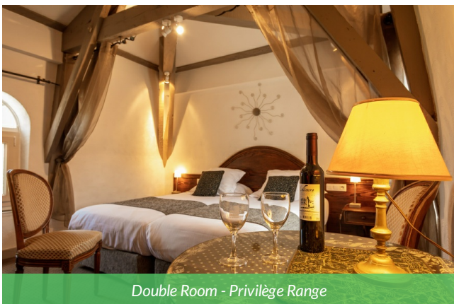
Double Room - Privilège Range

The hotel is a beautiful historic residence located in the historic center of Collioure, full of charm and character. Each room features unique décor, often rustic or in a “manor house” style, making every stay a different experience. The peaceful garden and heated pool provide a relaxing setting, perfect for unwinding after a day of sightseeing. The breakfast is carefully prepared, and the attentive service adds to a friendly and welcoming atmosphere.