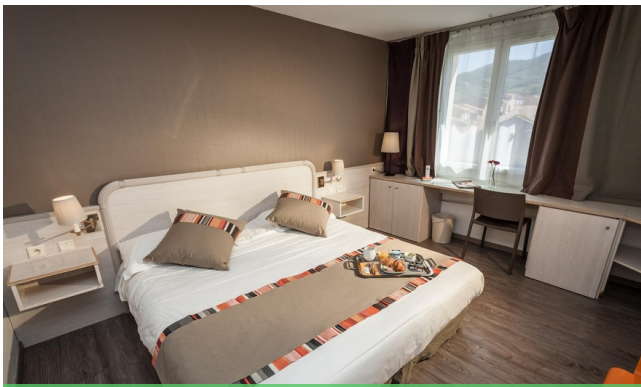
Double Room - Essential range