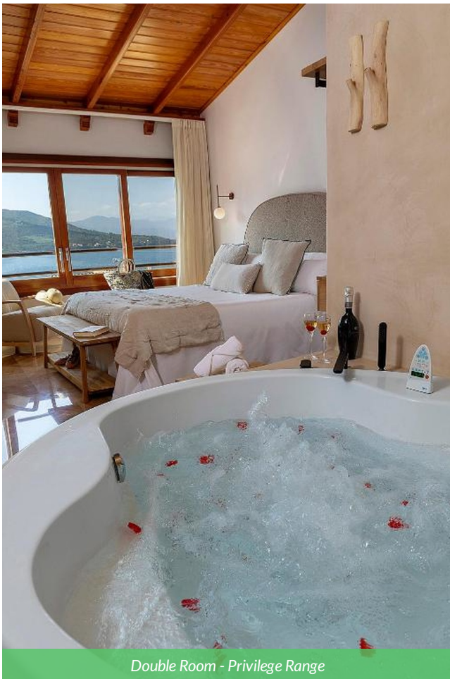
Double Room - Privilege Range

The hotel is a renovated former wine cellar located just 30 m from the beach, blending historic charm with modern comfort. The spacious, well-decorated rooms often feature a jacuzzi or whirlpool bathtub, and some have a terrace or sea view for a relaxing setting. The property offers a full wellness area with a spa, sauna, massages, and treatments—perfect for unwinding after a day of cycling. A buffet breakfast, Wi-Fi, and private parking are available, all just steps from the village center.