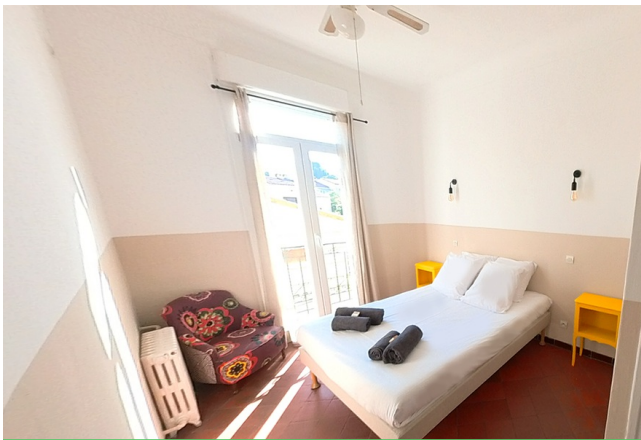
Double Room - Essential range

This accommodation is a friendly, family-run hotel-restaurant located in the heart of Banyuls-sur-Mer, just a short walk from the beach. Warm atmosphere, local cuisine, and attentive service. A homely, welcoming vibe with Mediterranean dishes prepared from fresh, local ingredients. Convenient for cycling travelers thanks to its central location and relaxed ambiance.