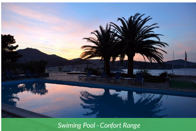
Swimming Pool - Confort Range

The hotel overlooks Banyuls-sur-Mer and offers stunning views of the bay. Calm and comfortable, it features bright rooms with balconies, perfect for enjoying the scenery. Two swimming pools and a wellness area provide relaxation after an active day. The restaurant serves simple and flavorful Mediterranean cuisine. A great choice for a restful stay, including for cycling travelers.