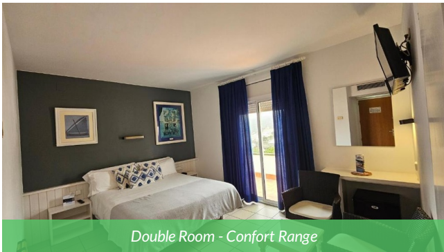
Double Room - Confort Range

The hotel in Cadaqués is a charming property situated on the heights of the village, offering breathtaking sea views. The comfortable rooms feature private bathrooms and, for some, a panoramic balcony. The hotel offers a hearty breakfast, a solarium with a swimming pool, and free Wi-Fi. Its peaceful location allows guests to enjoy both tranquility and proximity to the town center and the beach. An ideal spot for a relaxing stay in the heart of Cadaqués to conclude your trip.