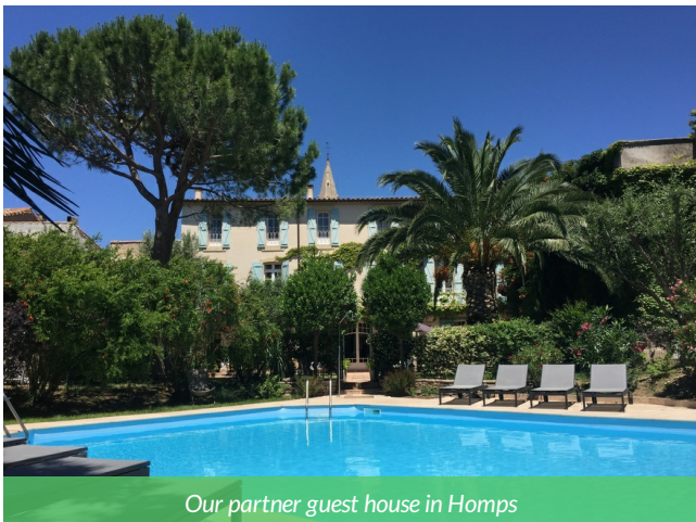
Our partner guest house in Homps

Not far from the Canal du Midi, this charming residence has all the ingredients to win you over: an exceptional old building, comfortable bedrooms, lush gardens... All with a friendly welcome. And don't forget to save a little time for a dip in the pool!