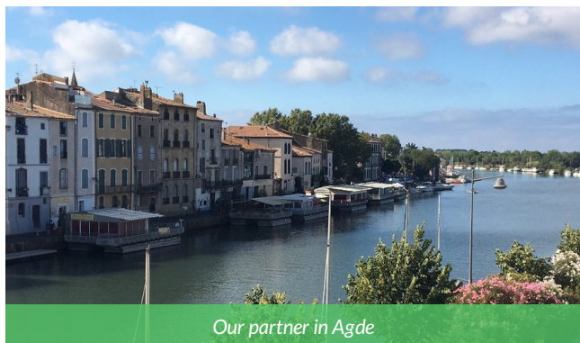
Our partner in Agde

Au bord du fleuve Hérault, près du Canal du Midi et de la cathédrale Saint-Étienne, cet hôtel offre un cadre agréable et familial. Il est idéalement placé pour explorer le centre historique d'Agde, avec un accès facile aux plages, au Cap d'Agde, et à la gare SNCF. Il est également proche de l'aéroport Béziers-Cap d'Agde et du Parc du Château Laurens