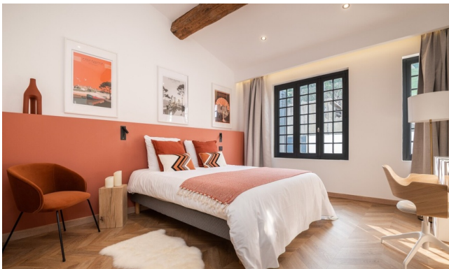
Notre hébergement partenaire à Carcassonne

La maison d'hôtes est idéalement située près de la Cité Médiévale de Carcassonne, à quelques minutes à pied du château Comtal et de la cathédrale. Elle propose des chambres élégantes, un jardin avec piscine extérieure, et des équipements modernes comme une terrasse ensoleillée et un café sur place. L'emplacement est parfait pour explorer la ville et ses alentours.