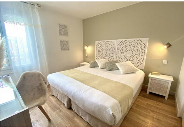
Notre hébergement partenaire à Agde

Cet hôtel 3 étoiles est situé à seulement 150 mètres de la plage Richelieu, au Cap d'Agde. Il propose des chambres climatisées et un cadre calme avec une piscine extérieure, un espace bien-être (sauna, hammam) et une terrasse ombragée. À proximité, profitez de la marina, des restaurants, des boutiques, ainsi que d'attractions telles qu'Aqualand et Luna Park, accessibles à pied. Il est également bien placé pour explorer la région, avec des pistes cyclables et des sites comme le Canal du Midi