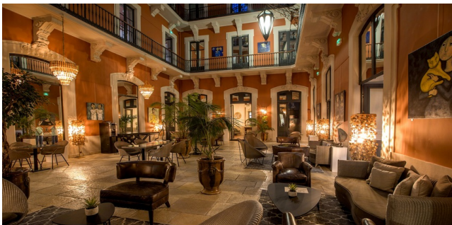
Our partner hotel in Sète

A charming hotel in the heart of Sète, offering a warm welcome in a 19th-century building. Close to the canals, the peacefulness of the glass-roofed patio is sure to delight. You can also enjoy a gourmet break in their restaurant, where you can sample delicious Mediterranean cuisine "between land and sea".