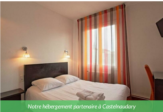
Notre hébergement partenaire à Castelnaudary

Situé au cœur de Castelnaudary, à seulement 300 mètres du Canal du Midi. Ce lieu emblématique propose une expérience typique de la gastronomie locale, mettant en avant le célèbre cassoulet de Castelnaudary, préparé avec des confits de canard et de porc. L'établissement dispose de chambres confortables et modernes, idéales pour une escapade gourmande dans la région du Lauragais, souvent surnommée la « capitale mondiale du cassoulet »