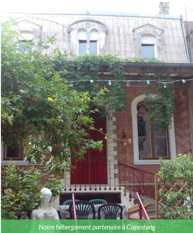
Notre hébergement partenaire à Capestang

Cette maison d'hôtes située au cœur de Capestang, à 500 m du Canal du Midi, offre un cadre calme et raffiné. Elle dispose de chambres confortables avec vue sur un jardin intérieur zen. Les hôtes proposent une table d'hôtes sur réservation, ainsi que des activités bien-être. Capestang, charmant village historique, est un excellent point de départ pour explorer la région, avec des plages proches et des sites comme le Canal du Midi et des châteaux cathares