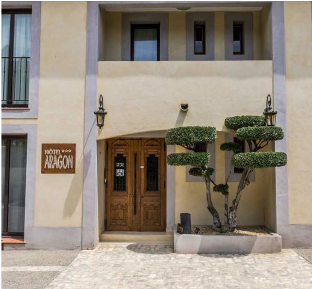
Our partner hotel in Carcassonne

old alike. With its private swimming pool and peaceful rooms, you're guaranteed to have a great time!