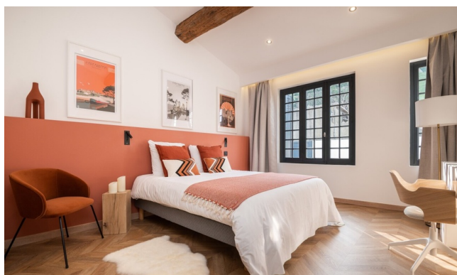
Our partner accommodation in Carcassonne