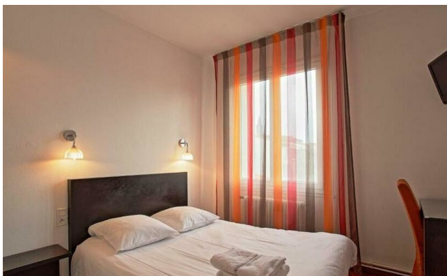
Notre hébergement partenaire à Castelnaudary