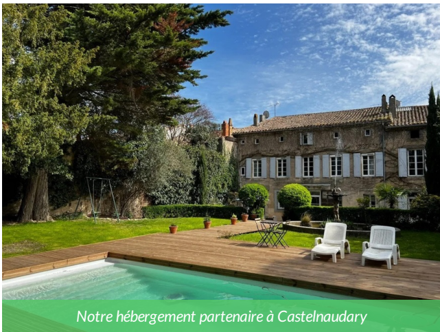
Notre hébergement partenaire à Castelnaudary