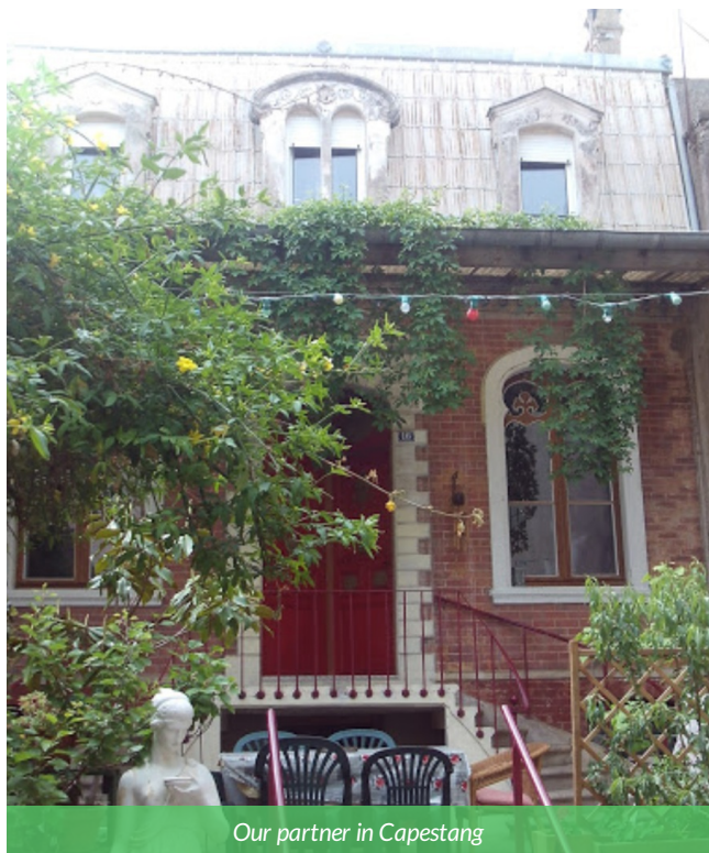
Our partner in Capetang

confortables avec vue sur un jardin intérieur zen. Les hôtes proposent une table d'hôtes sur réservation, ainsi que des activités bien-être. Capetang, charmant village historique, est un excellent point de départ pour explorer la région, avec des plages proches et des sites comme le Canal du Midi et des châteaux cathares