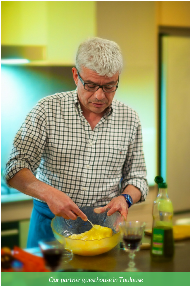
Our partner guesthouse in Toulouse