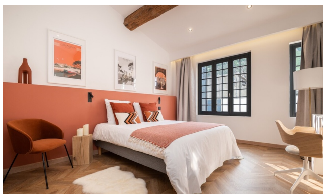
Notre hébergement partenaire à Carcassonne