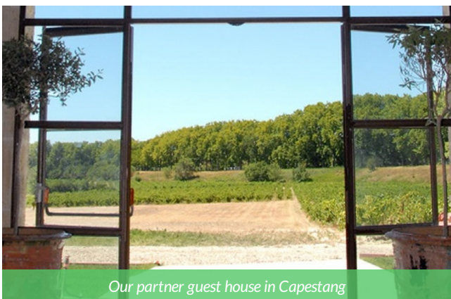
Our partner guest house in Capestang

Our partner guest house in Capestang, in the heart of the vineyards and with a famous table d'hôtes.