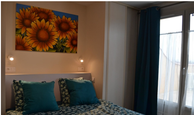
Our partner accommodation in Castelnaudary

This guesthouse offers air-conditioned rooms with garden views, as well as an outdoor swimming pool. Enjoy outdoor activities such as hiking and cycling.