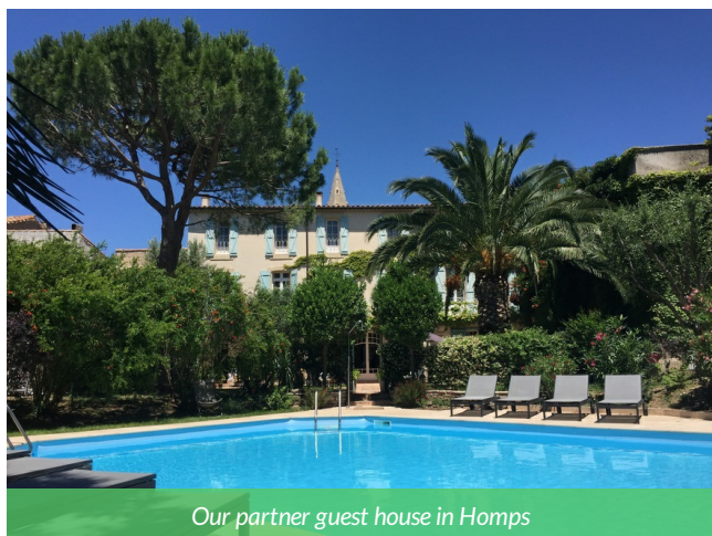
Our partner guest house in Homs

Not far from the Canal du Midi, this charming residence has all the ingredients to win you over: an exceptional old building, comfortable bedrooms, lush gardens... All with a friendly welcome. And don't forget to save a little time for a dip in the pool!