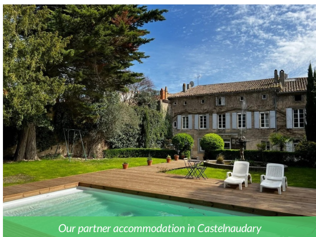
Our partner accommodation in Castelnaudary