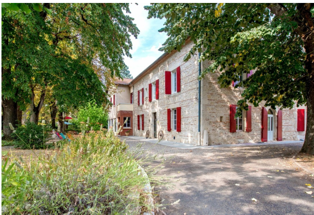
Our partner accommodation in Sérignac

Nestled in the heart of a wooded park, Frédérique and Carine invite you to a peaceful and comfortable retreat. Between bucolic charm and a relaxed atmosphere, it's an ideal place to unwind while exploring the surroundings at your own pace.