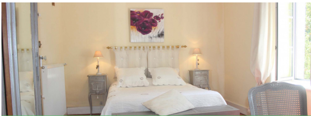
Our partner accommodation in Capestang