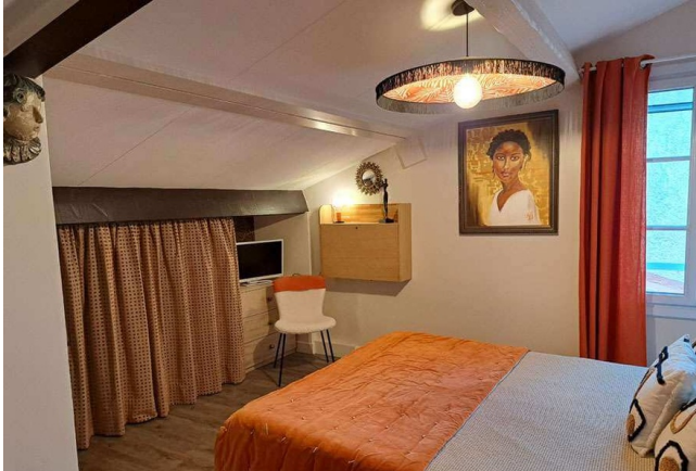
Our partner guest house in Agde