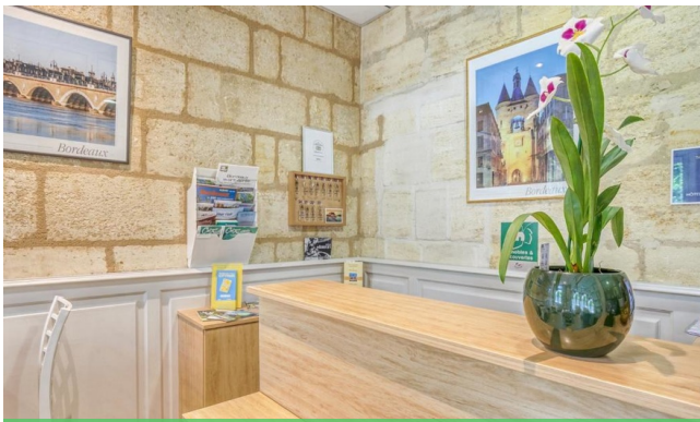
Our partner accommodation in Bordeaux