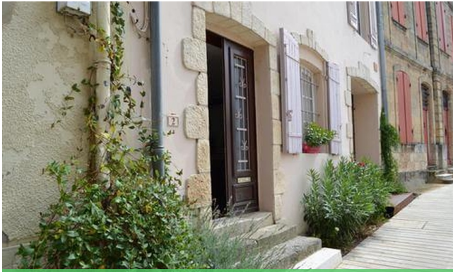
Our guesthouse partner in Le Mas d'Agenais

Our guest room in Mas-d'Agenais offers a peaceful and welcoming setting, ideal for relaxation. The place combines charm and simplicity, close to the Garonne Canal and the heart of the village.