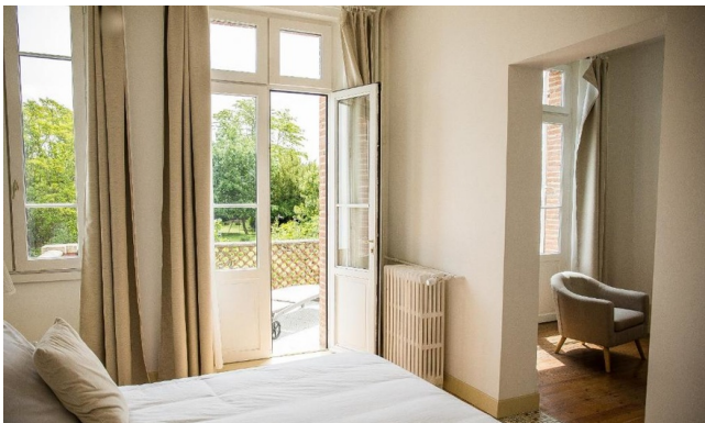
Our partner hotel in Moissac

Not far from the abbey of Moissac, this old house offers you a bright and comfortable place with its large garden and its superb swimming pool. Don't forget to reserve your table at the hotel's restaurant for a delicious meal.