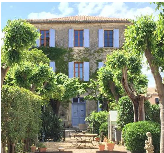
Our partner guest house in Homps

You will find spacious and comfortable rooms, a pleasant swimming pool to refresh yourself after your journey, and above all, a caring host passionate about his region.