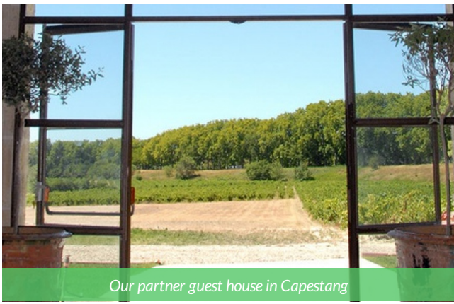
Our partner guest house in Capestang