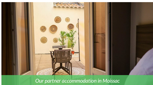
Our partner accommodation in Moissac