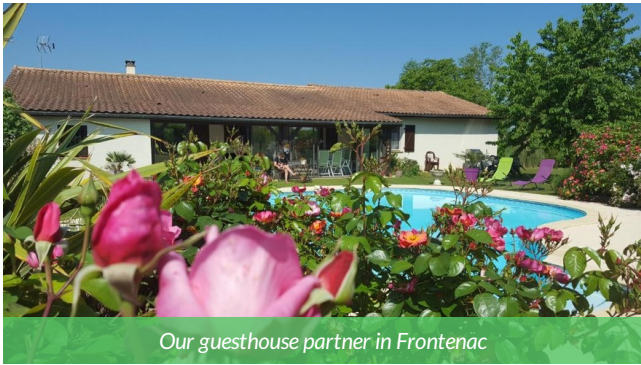
Our guesthouse partner in Frontenac