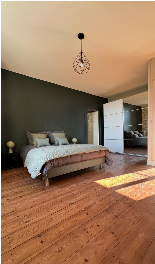
Our partner guesthouse in Sauveterre de Guyenne

Come discover this cottage nestled in the heart of the countryside of Sauveterre-de-Guyenne, surrounded by nature and majestic tall trees. Ideal for a green getaway, it offers a peaceful and spacious setting, perfect for recharging with family or friends while enjoying the authentic charm of Entre-deux-Mers.