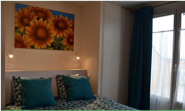
Our partner accommodation in Castelnaudary