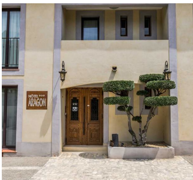
Our partner hotel in Carcassonne

Just 50 metres from the historic centre of Carcassonne in the Aude and its medieval fortress gates, this charming hotel will delight young and old alike. With its private swimming pool and peaceful rooms, you're guaranteed to have a great time!