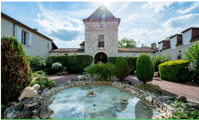
Our partner accommodation in Sérignac