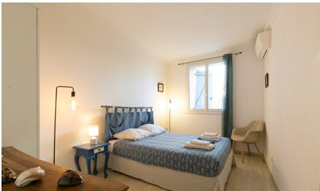
Our guesthouse partner in Sète

Discover this cosy guest house run by a small Italian family. You can relax in the peace and quiet of their outdoor courtyard, while remaining right in the center of Sète.