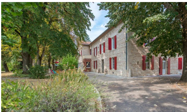
Guesthouse - Confort Range