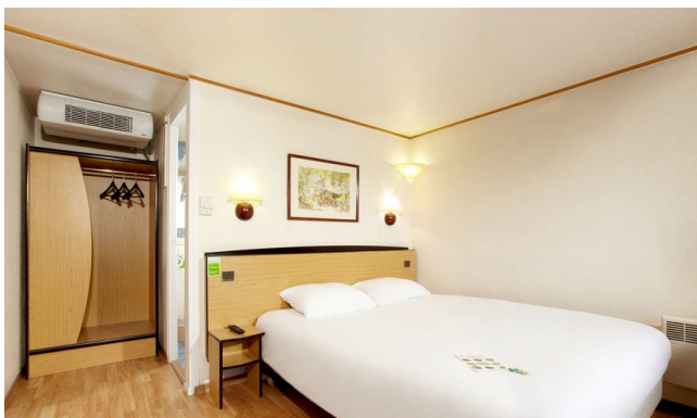
Double Room - Essential range

Located in the heart of Lot-et-Garonne, just a short ride from major cycling routes and the Canal des Deux Mers, this welcoming stopover is ideal for cyclists. Designed with cycle travelers in mind, it offers a peaceful atmosphere, comfortable air-conditioned rooms, secure bike storage, a homemade dinner, and a generous breakfast. A practical and relaxing place to rest and recharge before continuing your journey.