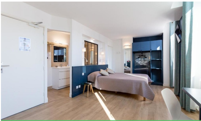
Double Room - Confort Range