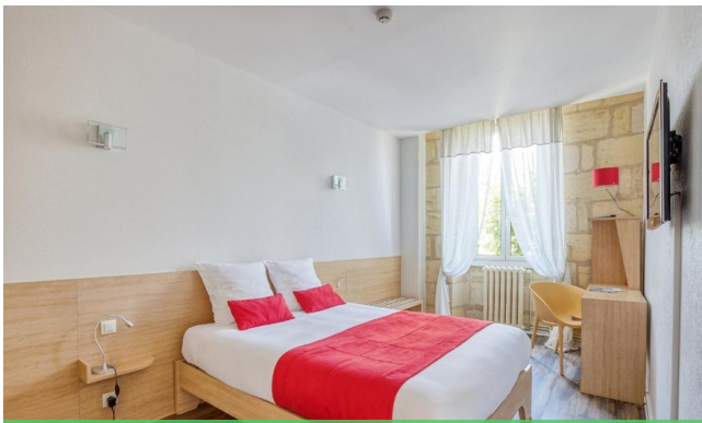
Double Room - Premium Range