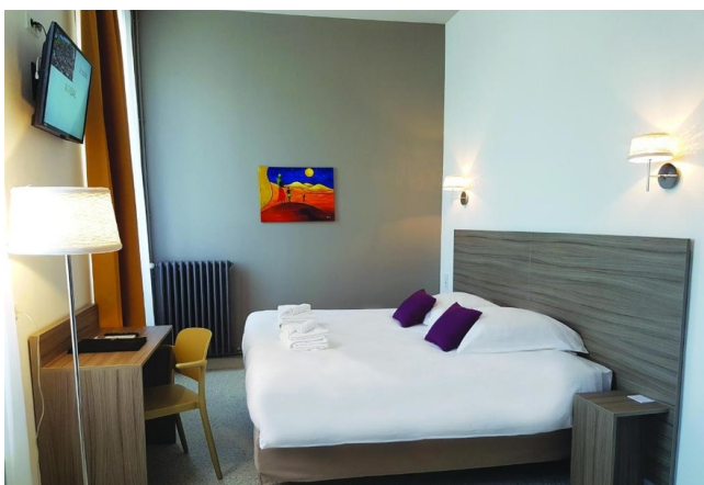
Double Room - Confort Range

An ideal stop along your route, Moissac charms visitors with its Romanesque abbey, remarkable cloister, and peaceful atmosphere along the banks of the Tarn River. This friendly 3-star hotel is a perfect place to combine cultural discovery and relaxation, offering comfortable, recently renovated rooms that reflect the warmth and character of Southwest France. The bar and restaurant welcome you to enjoy fresh, high-quality regional products in a convivial setting.