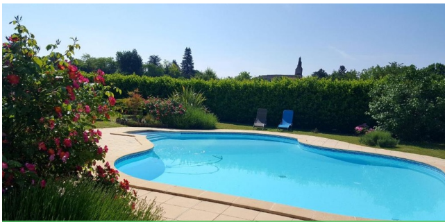
Swimming Pool - Confort Range

Nestled in a peaceful and green setting, this guesthouse welcomes you for a stay focused on relaxation and refinement. Each room combines traditional charm with modern comfort. Outdoors, you can enjoy a tree-lined garden, a sunny terrace, and a beautiful swimming pool — perfect for unwinding after a day of exploration or for enjoying breakfast in a calm and serene atmosphere. An ideal place to reconnect with nature.