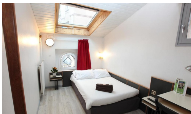
Double Room - Essential range

Ideally located just a short walk from Toulouse train station and along the banks of the Canal du Midi, this hotel is the perfect place to end your journey. Certified Accueil Vélo, it offers secure bike storage and services tailored to cycling travelers. With comfortable rooms, a 24-hour reception, and breakfast served from 6:30 a.m., it provides a practical and peaceful stopover in the heart of Toulouse.