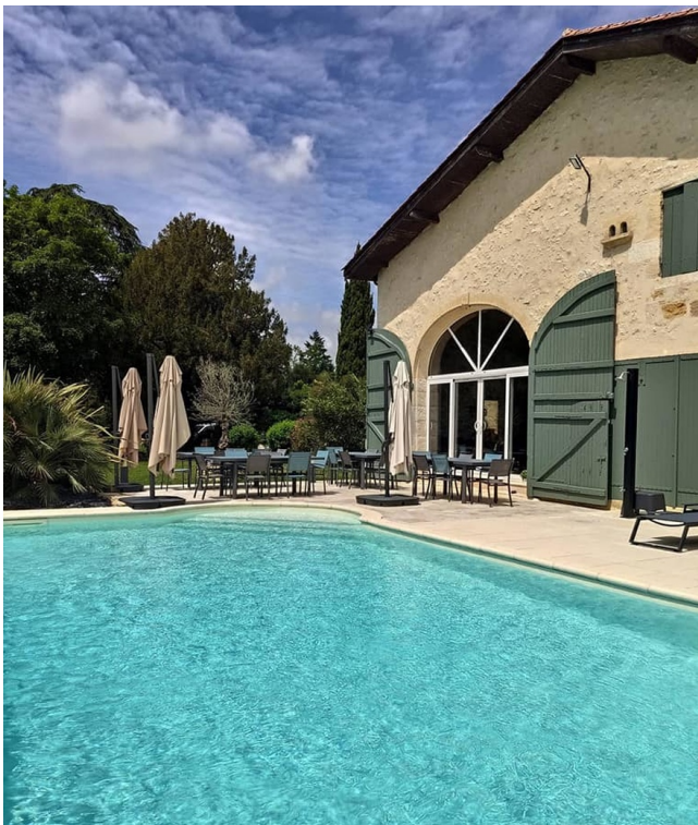
Swimming pool - Premium Range

Come and discover this charming gîte nestled in the countryside of Sauveterre-de-Guyenne, surrounded by nature and majestic old trees. Ideal for a peaceful getaway, it offers a spacious and serene setting, perfect for relaxing with family or friends while enjoying the authentic charm of the Entre-deux-Mers region. This exceptional property, a former wine château fully renovated with care, provides absolute comfort and invites you to unwind in a truly restful environment — with the added pleasure of a dip in the heated outdoor swimming pool.