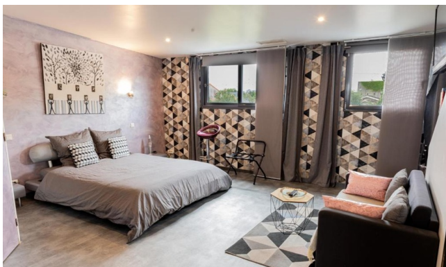
Double Room - Essential range