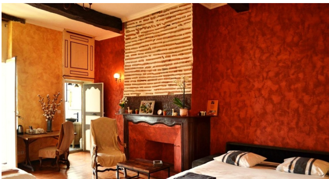
Double Room - Confort Range

In the heart of the charming village of Mas-d'Agenais, one of the oldest communities in Lot-et-Garonne, Patricia and Gilles welcome you into a guesthouse rich in history. Once a 16th-century relay post, the house overlooks the Garonne Lateral Canal from a series of lush terraces, offering peace, beautiful views, and a true sense of serenity. Comfortable rooms, a natural outdoor setting, attentive hosts, generous breakfasts, and packed lunches all come together to make this a truly appealing and restful stopover.