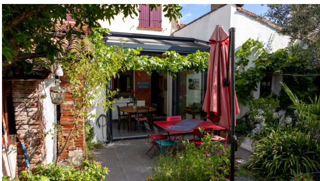
Garden - Confort Range