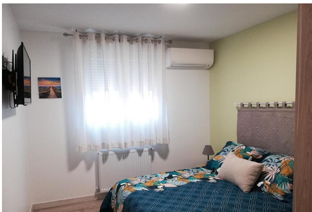
Double Room - Essential range

Located in the small village of Frontenac near the bicycle path, this bed and breakfast has all the necessary amenities for your overnight stay. You can dine at the bar-restaurant of the same establishment in the evening.