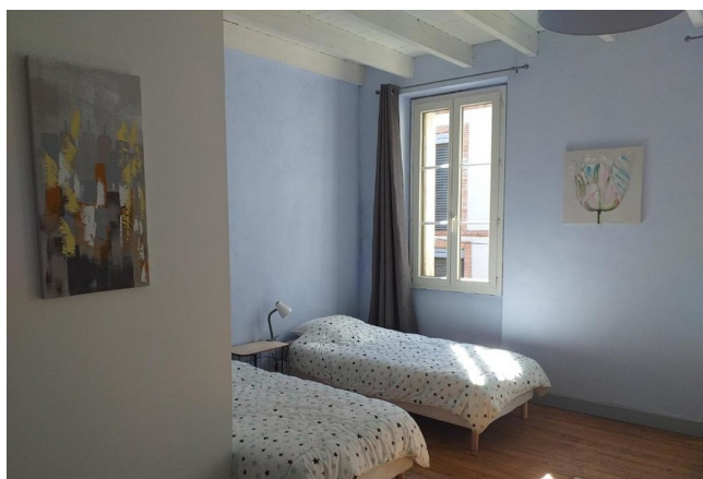
Double Room - Essential range

Nestled in the heart of Moissac, this warm and welcoming inn, run by Agnès, a former pilgrim, is ideal for cyclists seeking rest and relaxation. Set in a charming house with a garden and terrace, it offers simple and soothing rooms. Shared meals, a family atmosphere, breakfast and half-board options — everything is designed for an authentic and rejuvenating stopover.