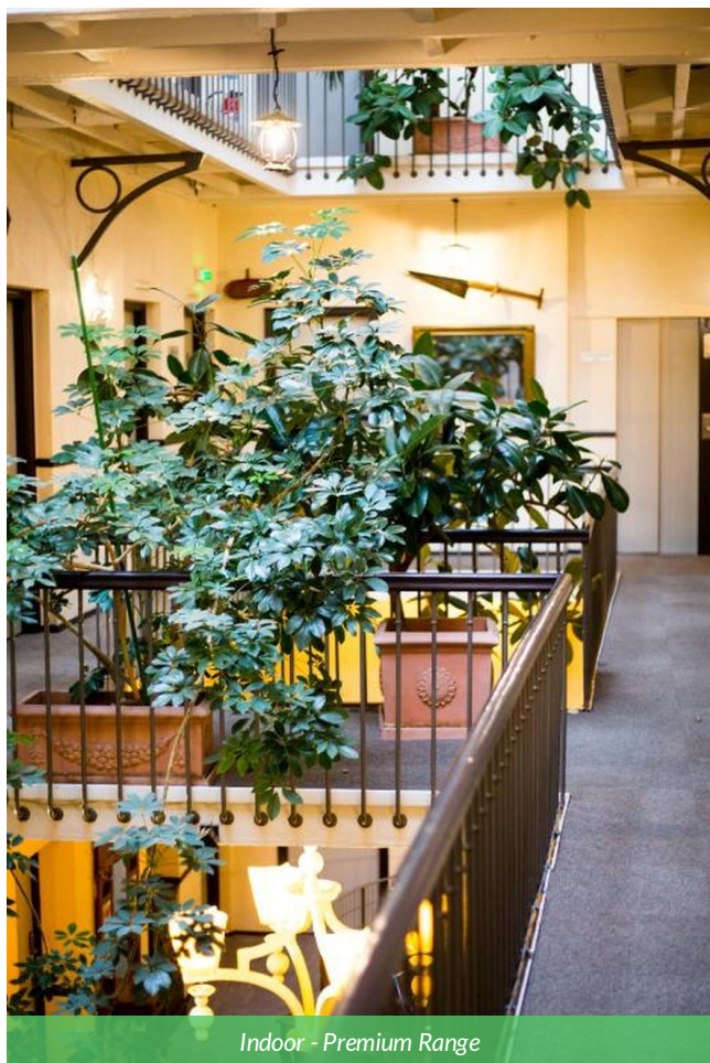
Indoor - Premium Range