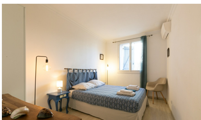
Bnb in Sète

For this package, we offer a selection of comfortable 2 or 3* hotels or Bnb.