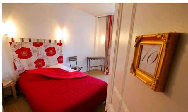
Hotel in Béziers